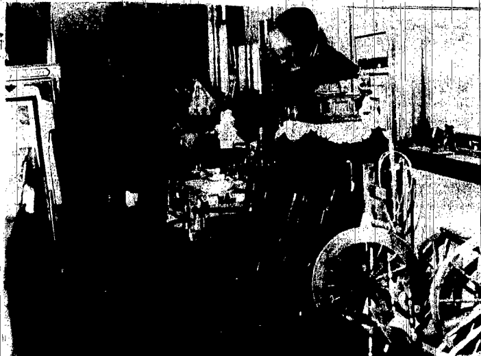
WAYNE COUNTY HISTORY, in a small box is available floor space has been used for storage, making many of the displays very ineffective. This is one of the items the Wayne County Historical Society hopes to correct following their incorporation and establishment.

The Wayne Herald reminds writers to get an early start on stories planned for the writing contest sponsored by The Herald. There will only be seven issues from Mar. 1 to Apr. 15 in which the articles can appear, according to rules of the contest. The articles must be published to be eligible for prizes and must be about places of interest, things to see and do, and things to attract people to our area.